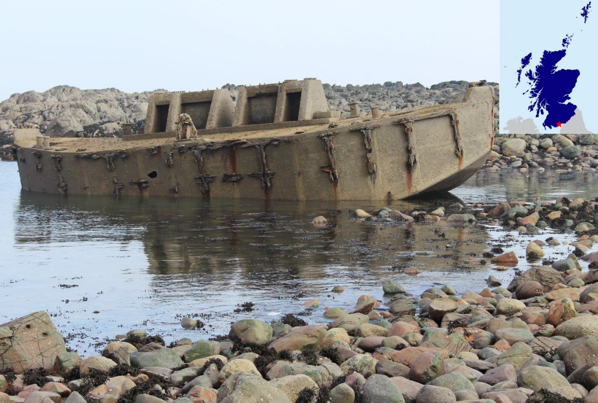
Part of a WW2 Mulberry harbour, Solway Firth