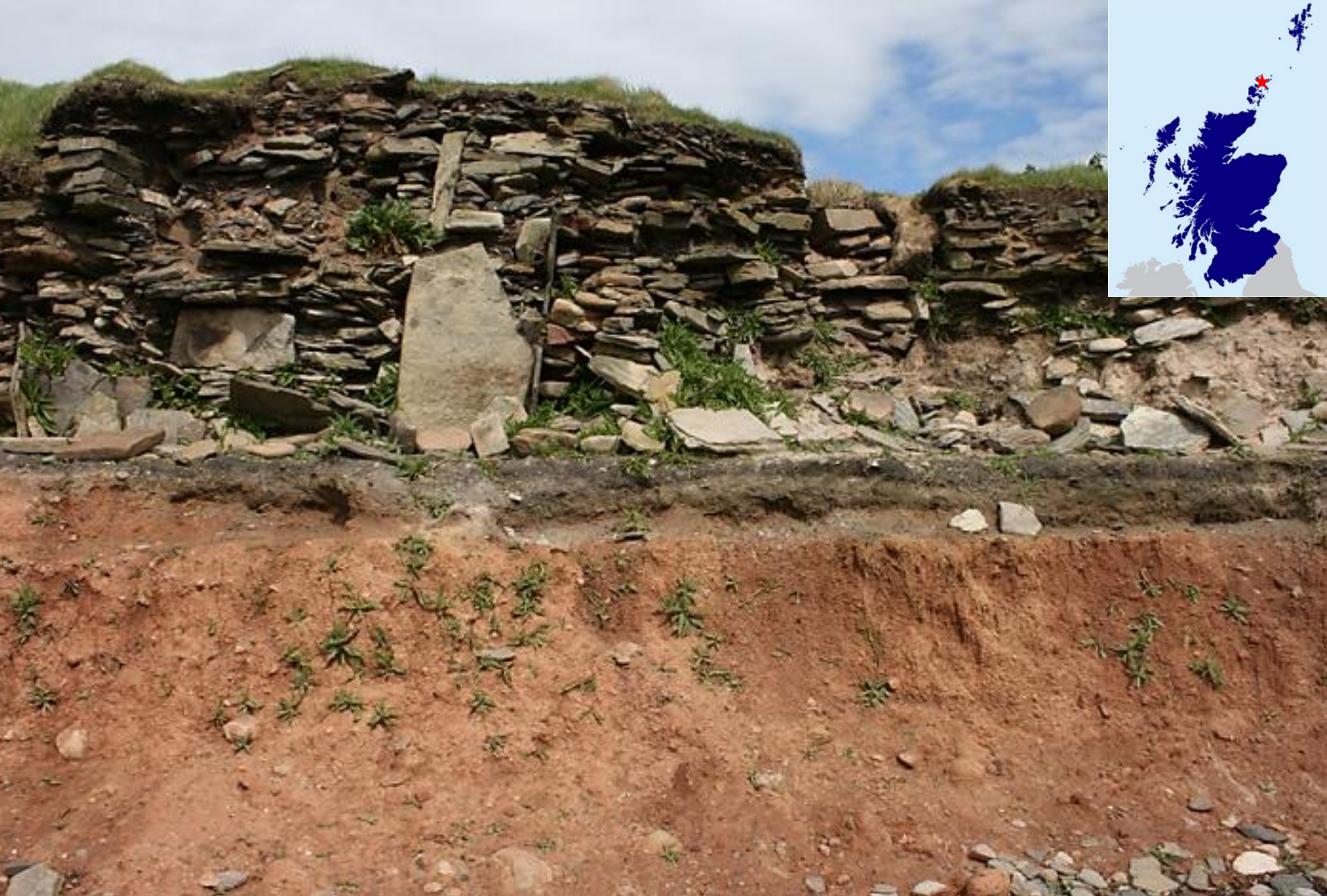
Medieval structures, Eday