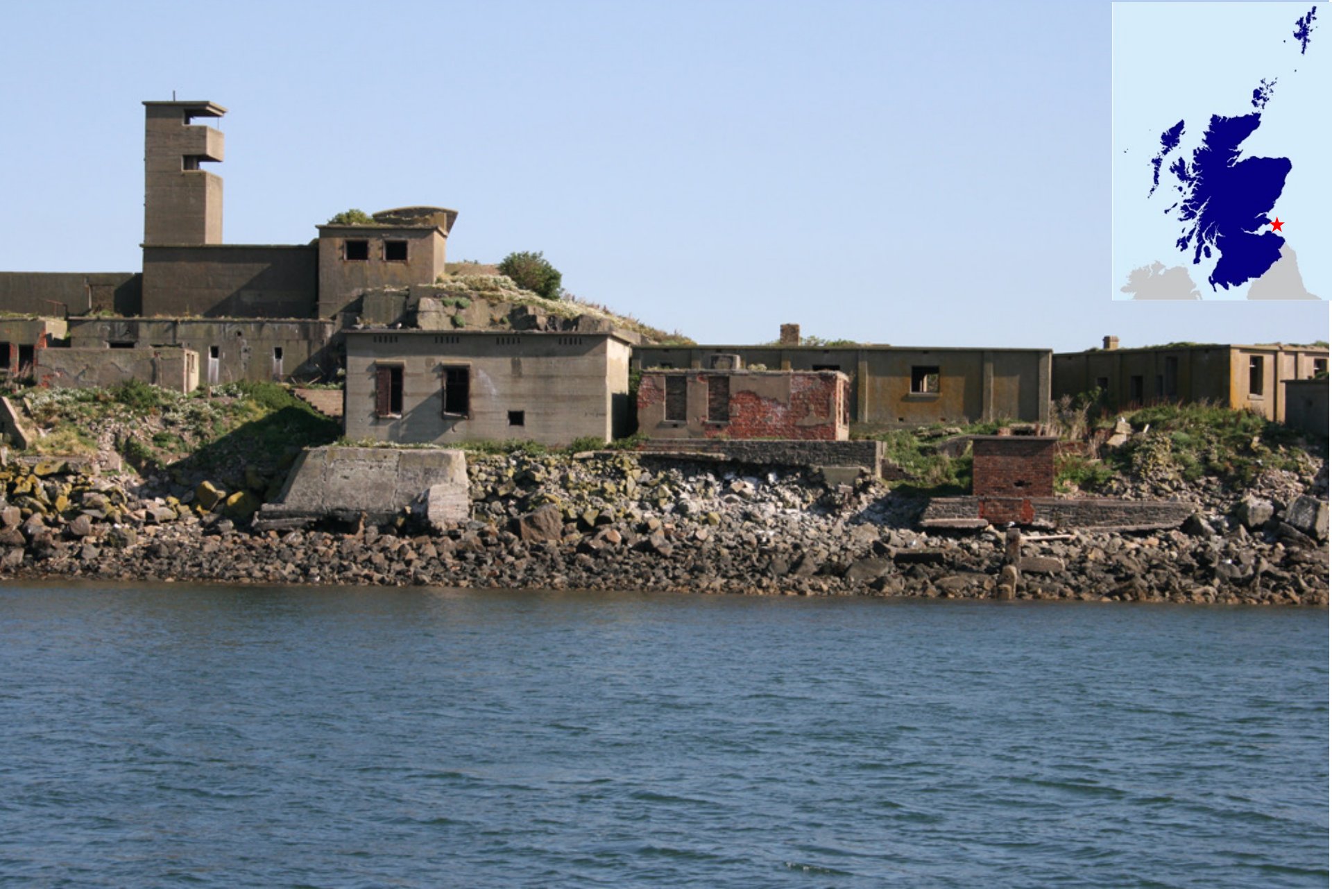
WW2 defences, Inchgarvie Island