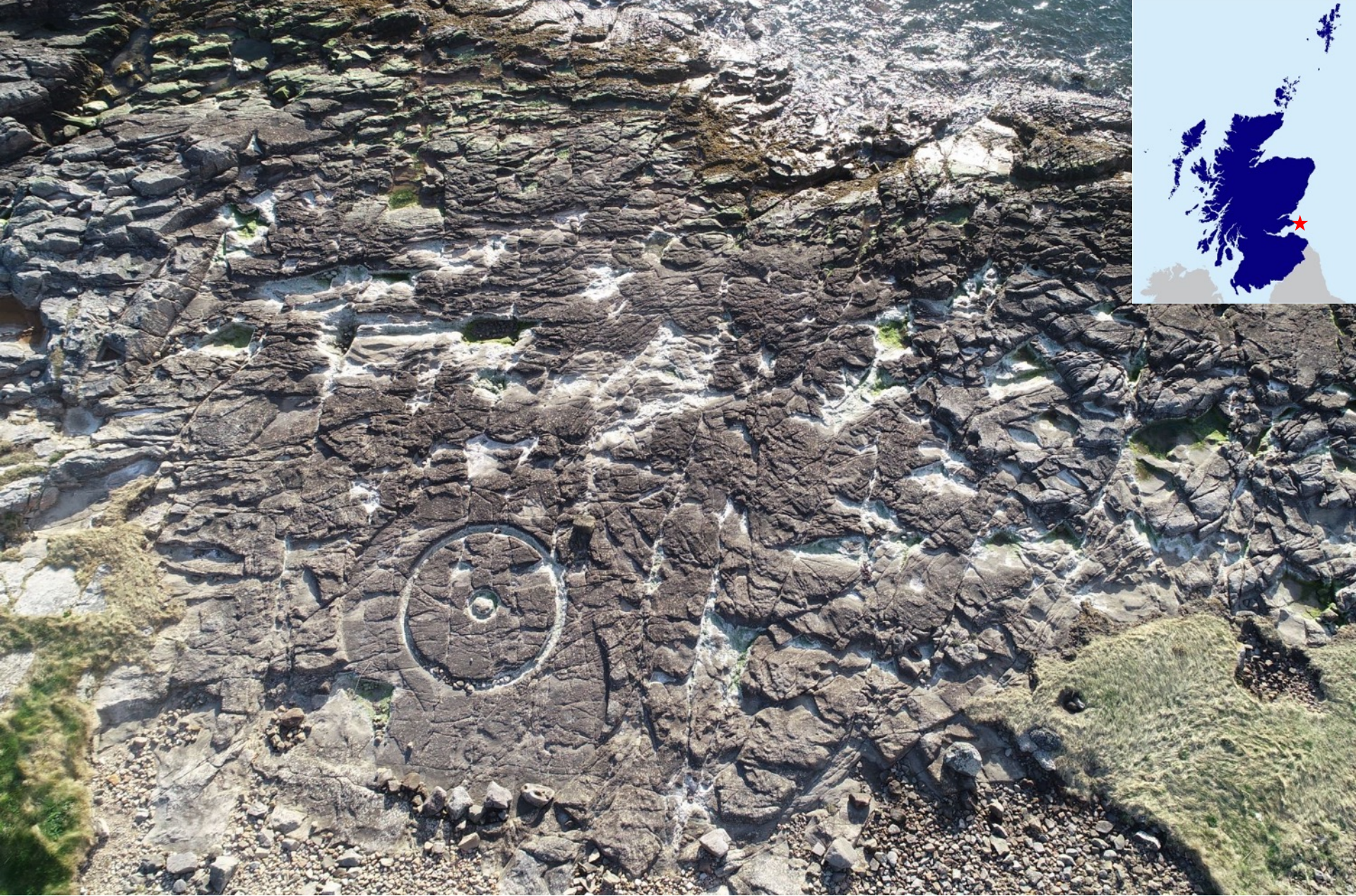
Early 19 th century beacon fabrication yard, Fife Ness