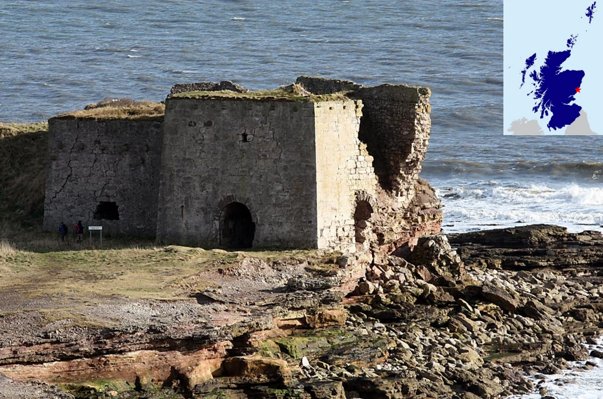
18 th century limekiln, Boddin Point