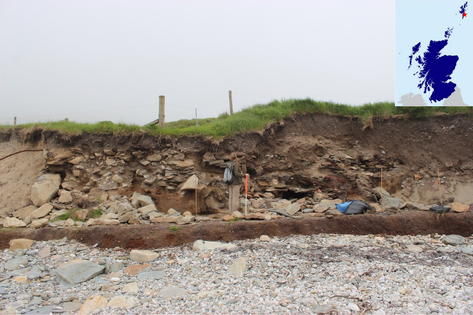
Iron Age broch, Shetland