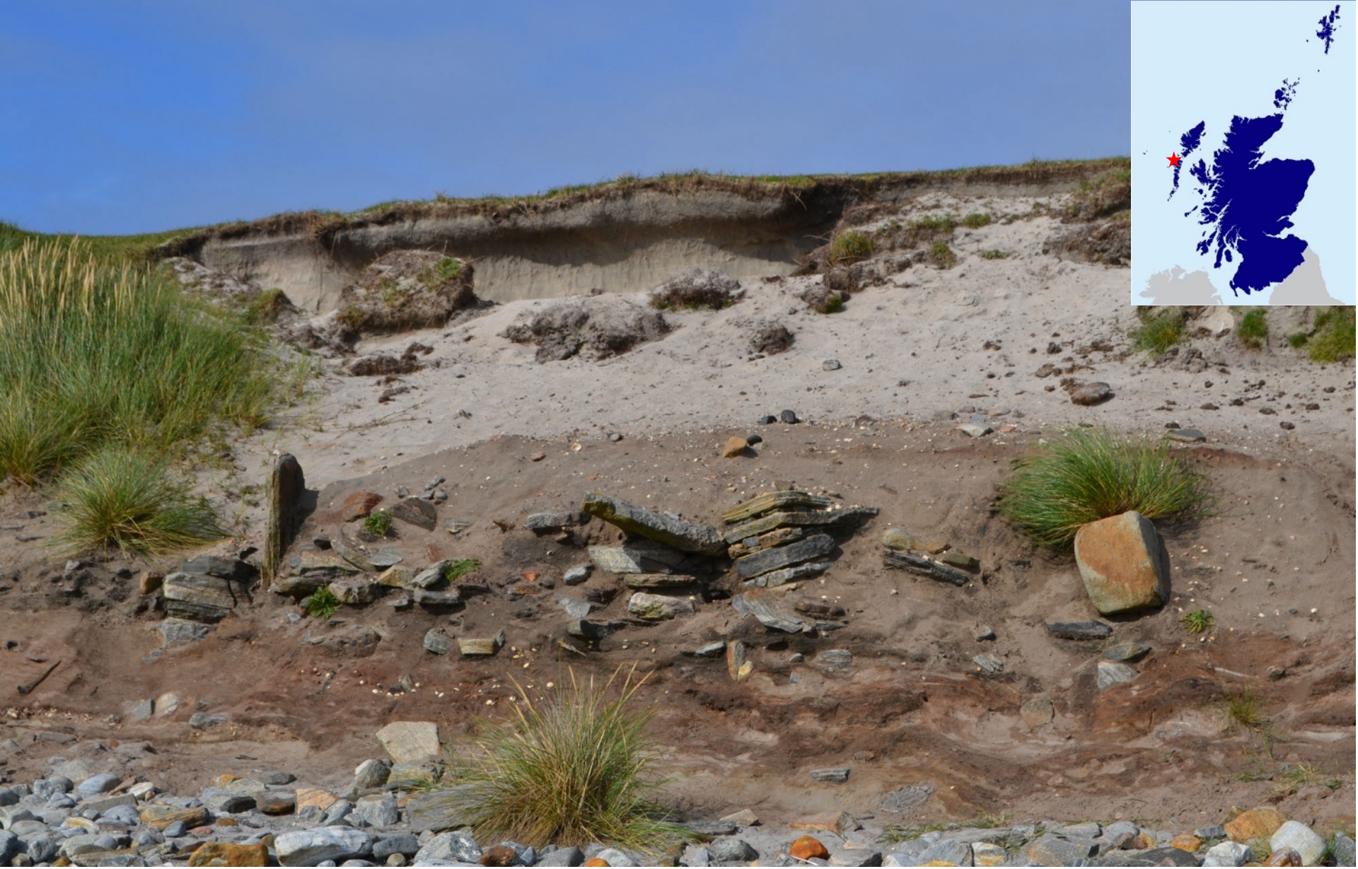
Iron Age wheel house, Baile Sear, North Uist