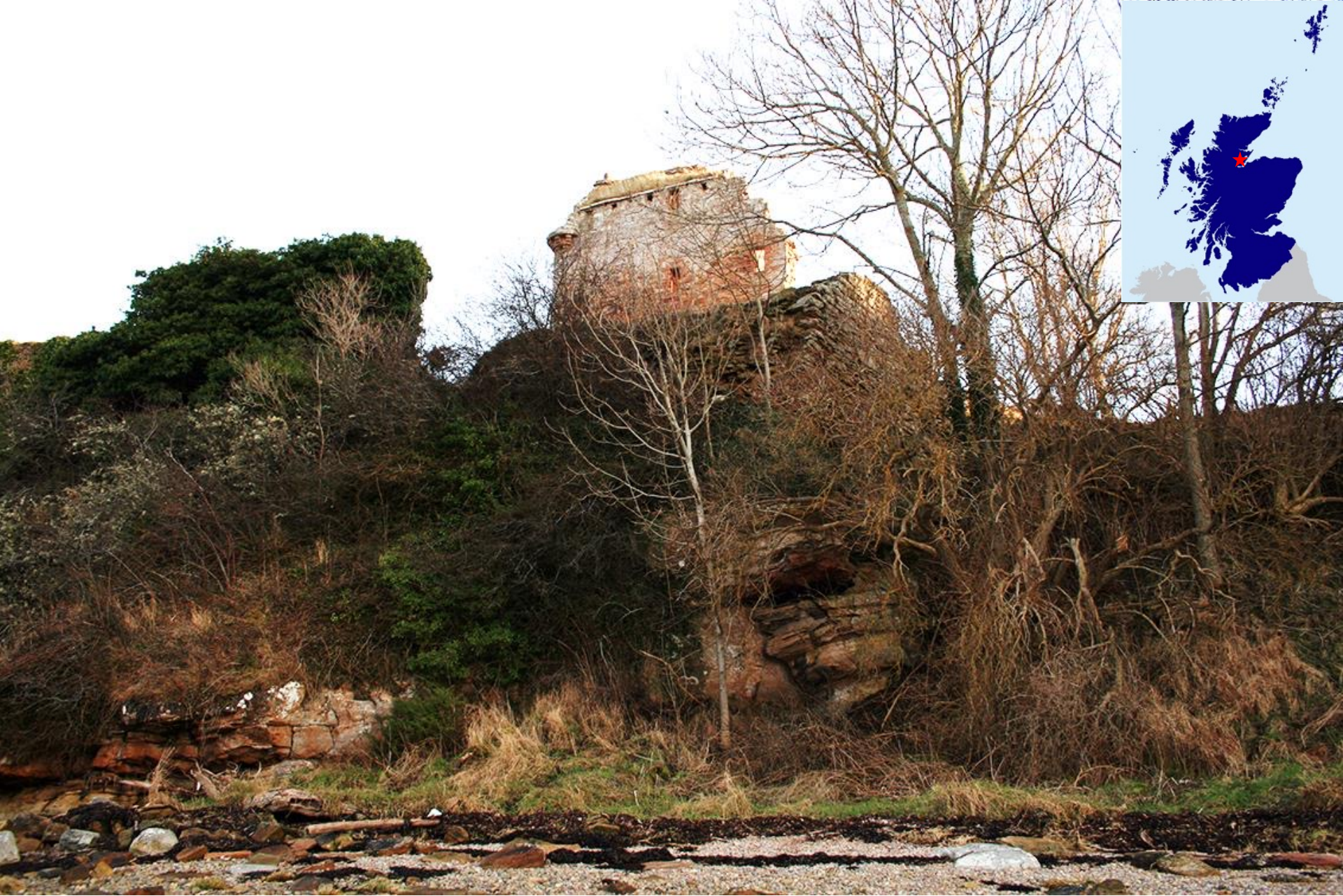
16 th century Castle Craig tower house, Cromarty Firth