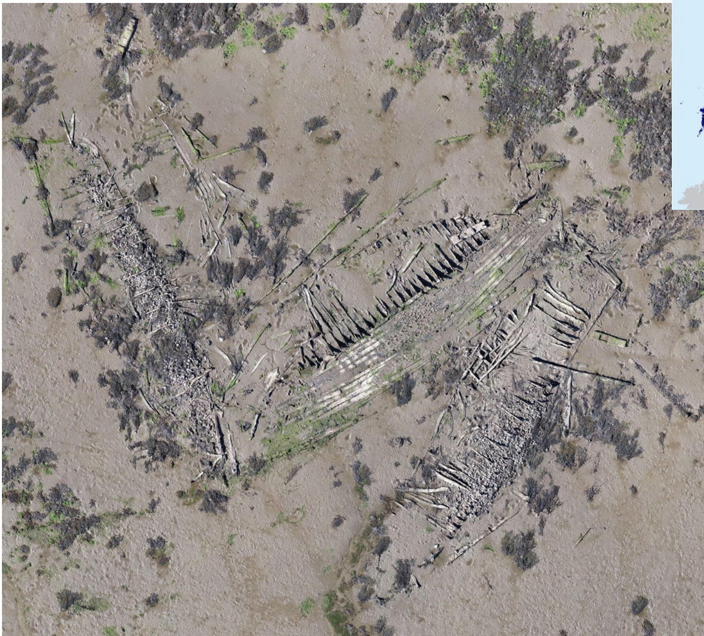
19 th /20 th century fishing boat graveyard, near Inverness