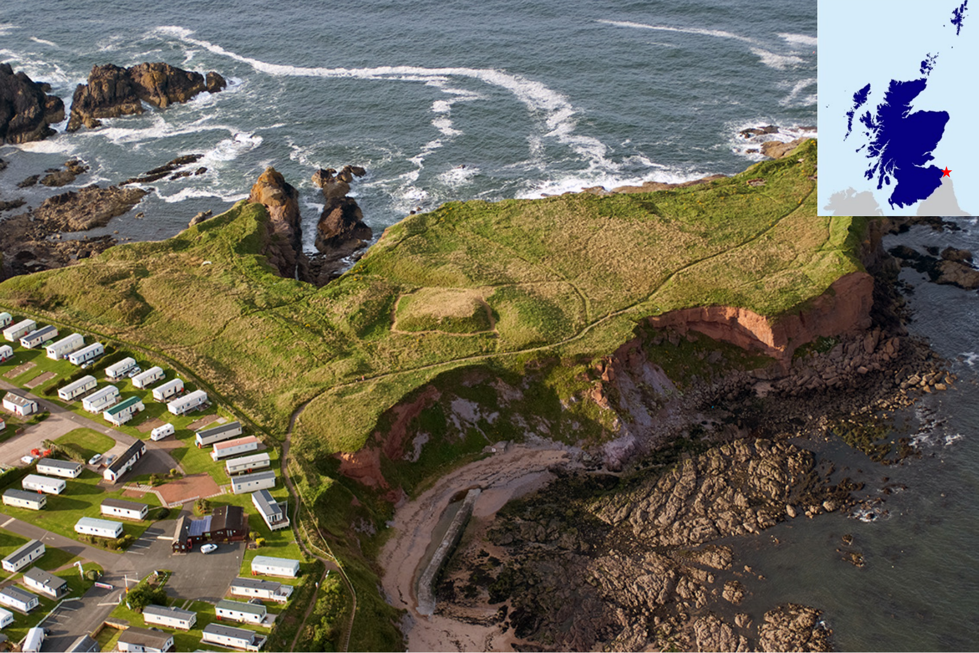
Eyemouth Fort, 16 th century Trace Italienne fort