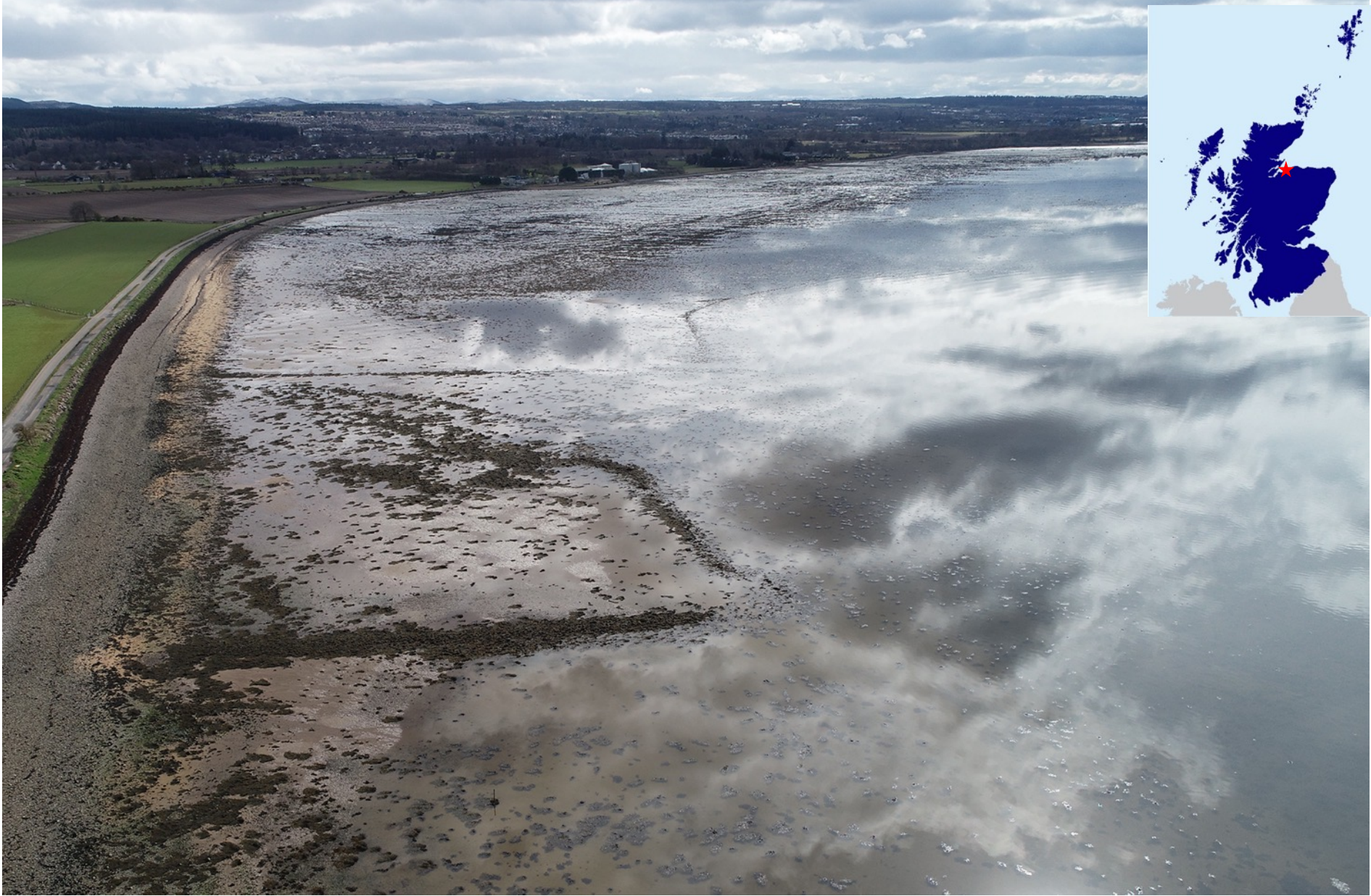
18 th -19 th century fishtraps, near Inverness