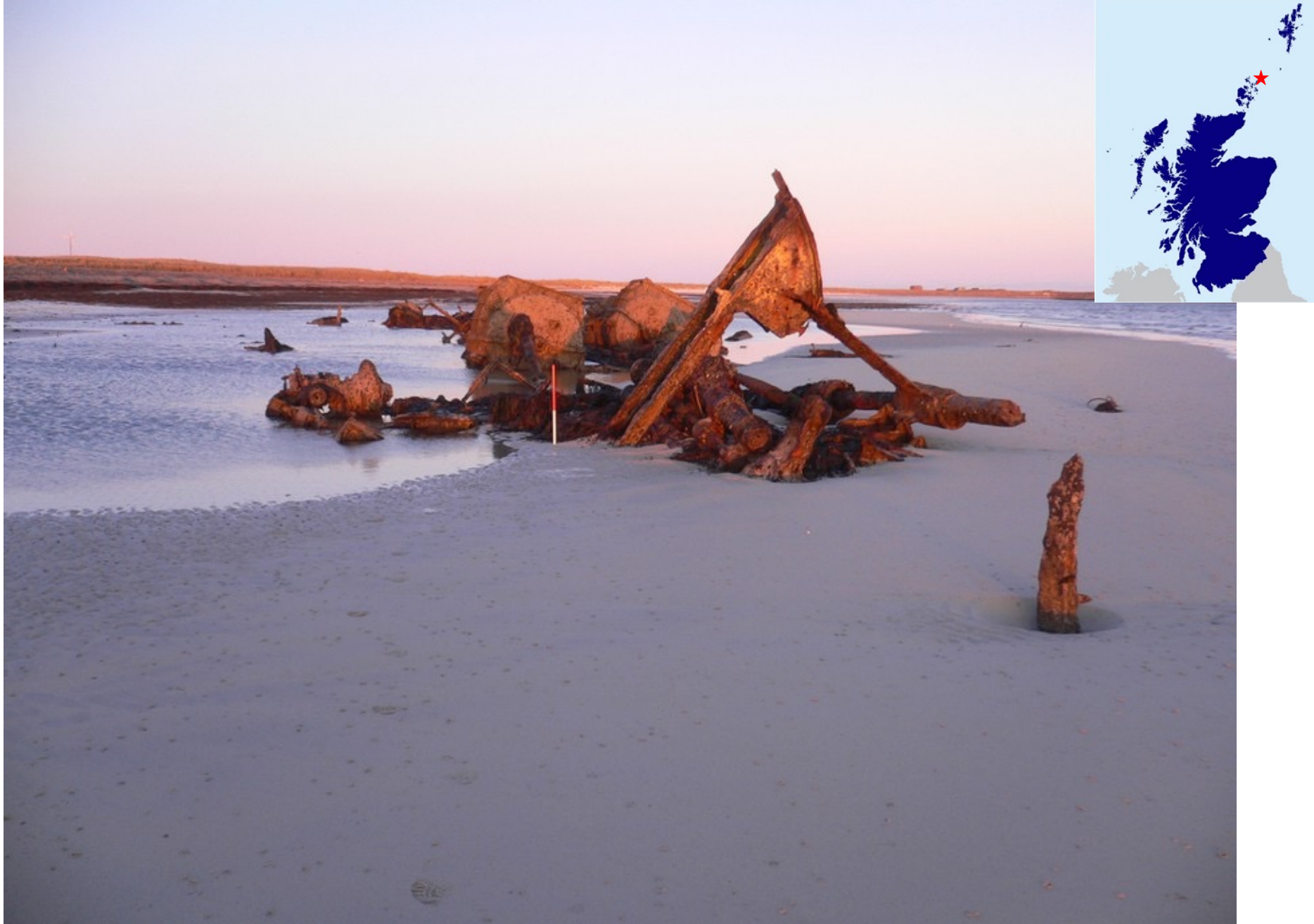
WW1 German wreck, Bay of Lopness, Sanday