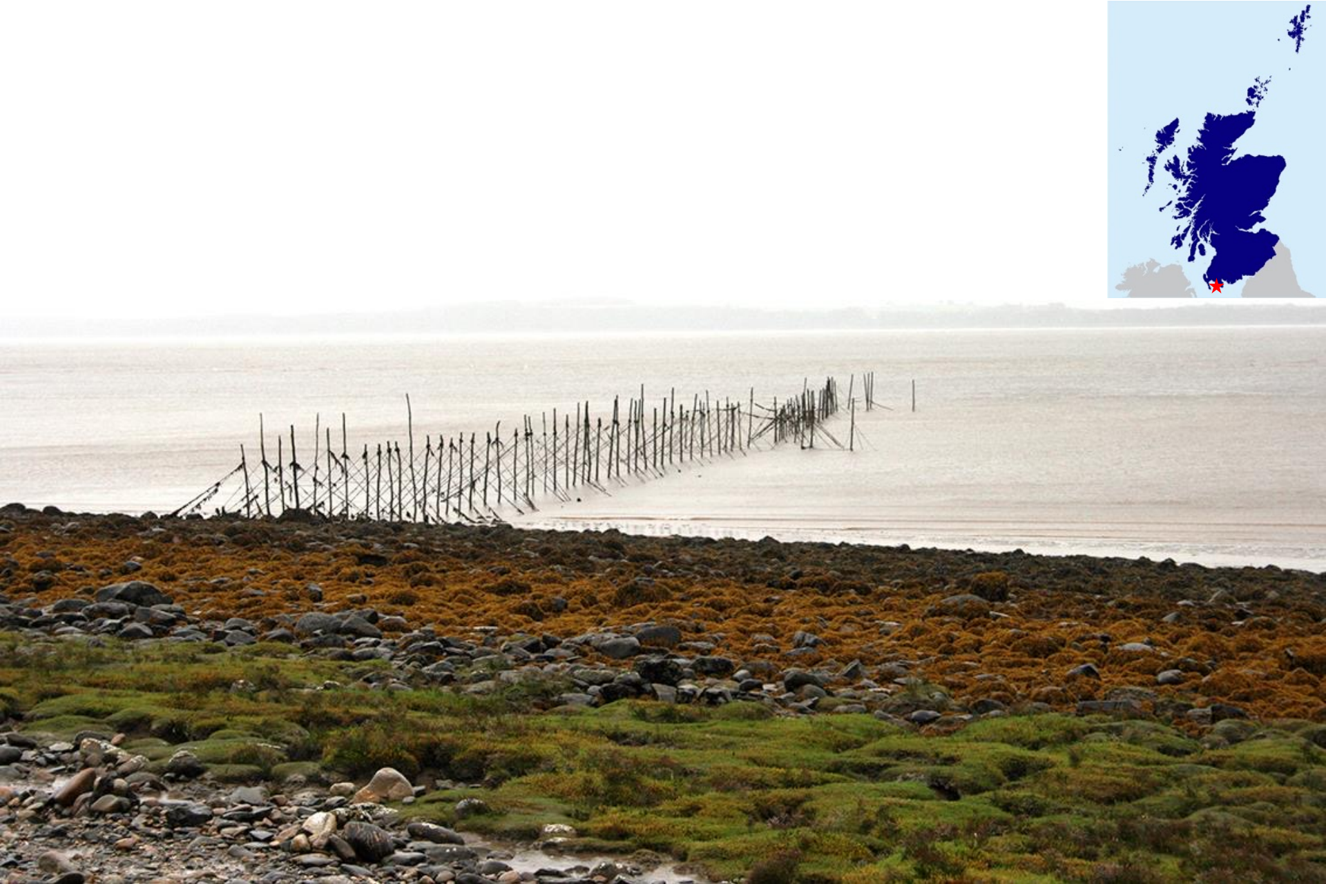
20 th century salmon stake nets, Carsluith, Solway Firth