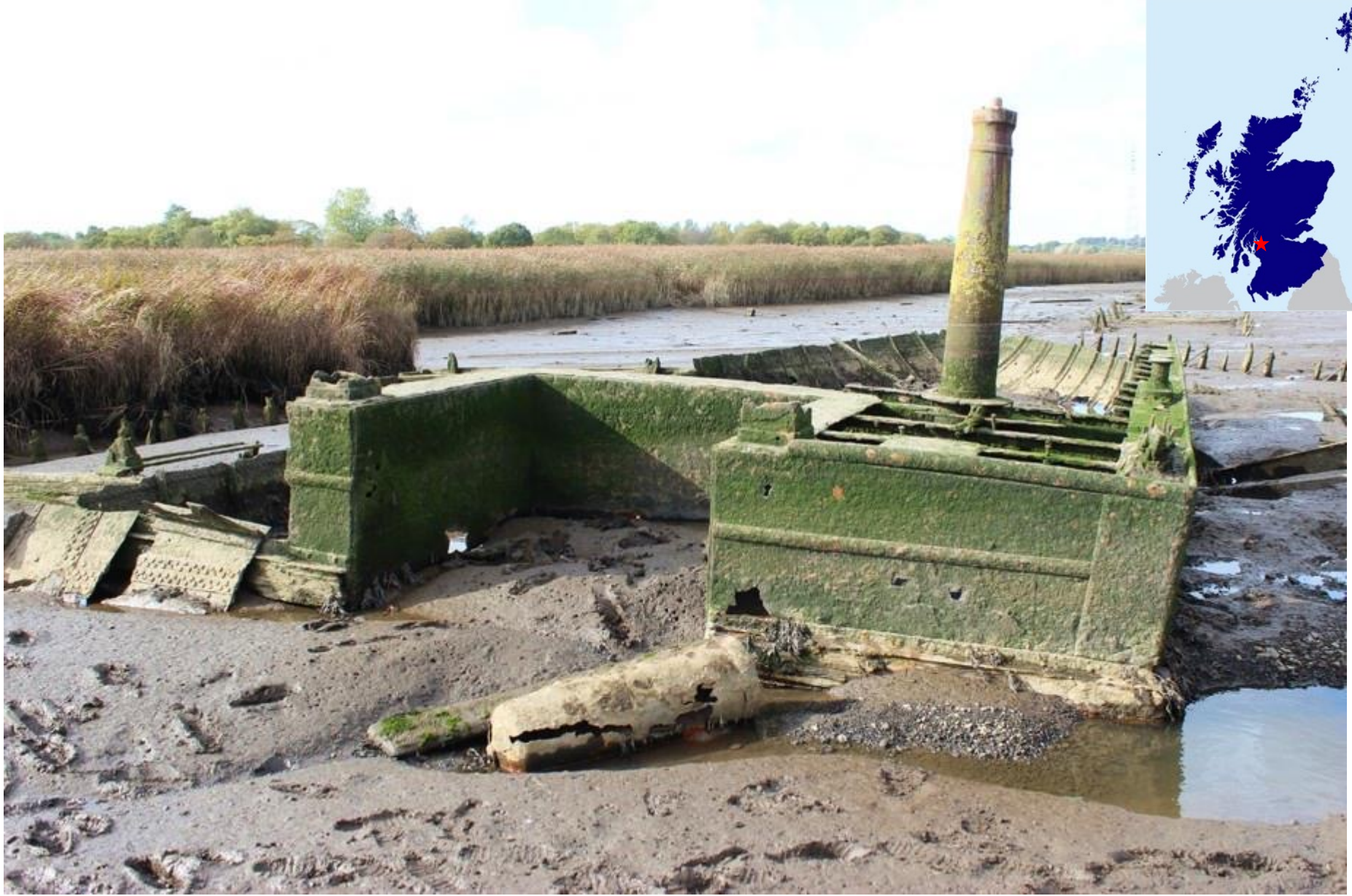
Early 19 th century diving bell barge, the Clyde