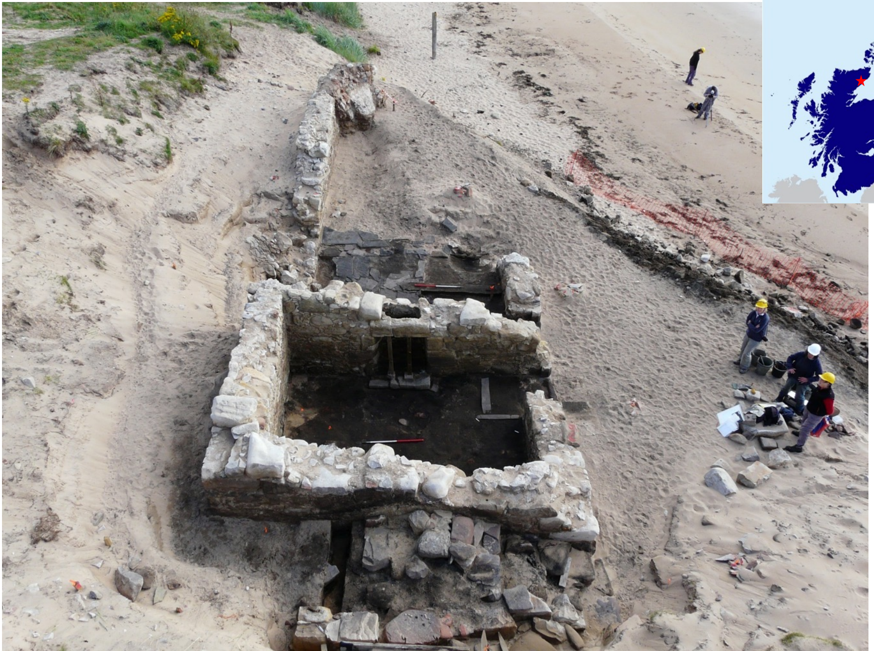
16 th century salt ginal, Brora