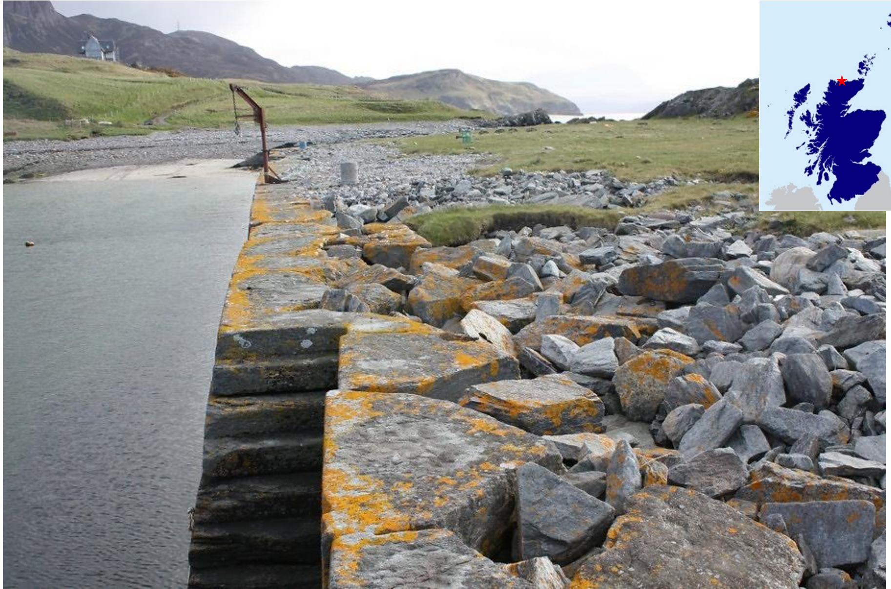
19 th century disused harbour, Skullomie