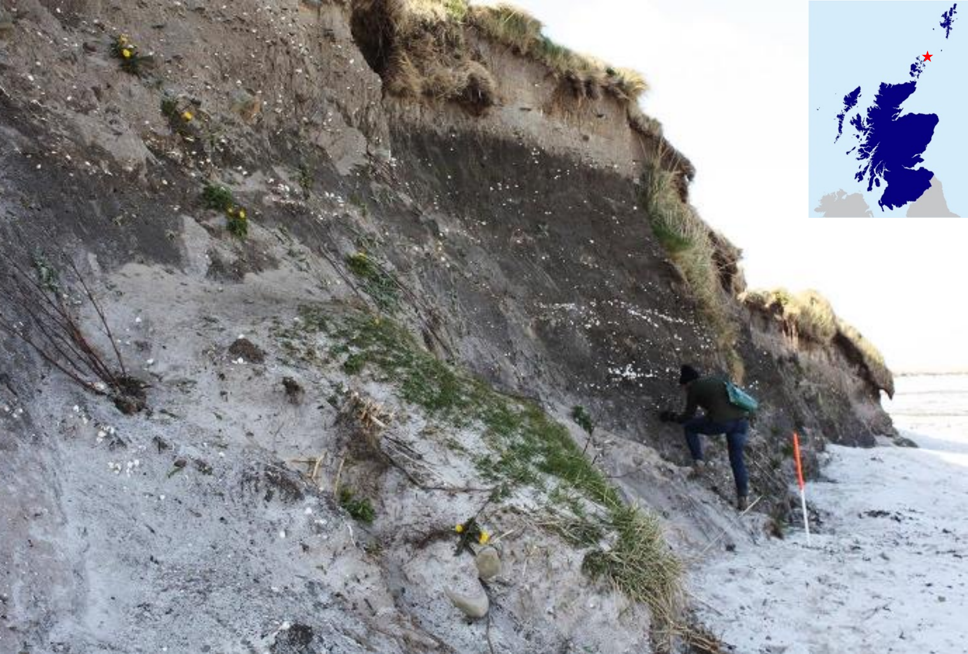
Norse? Settlement mound, Sanday