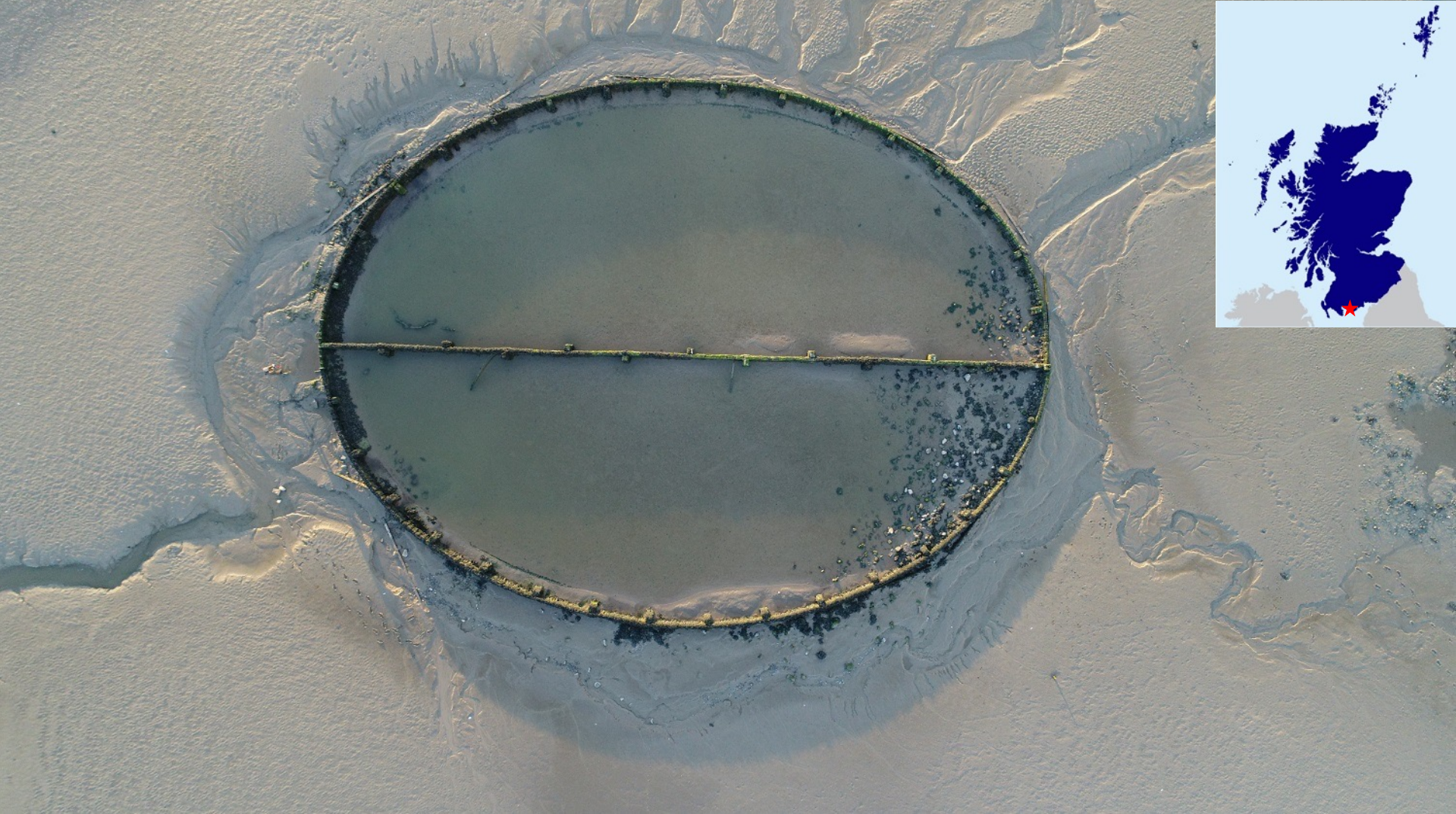
19 th century swimming pool, Powfoot, Solway Firth