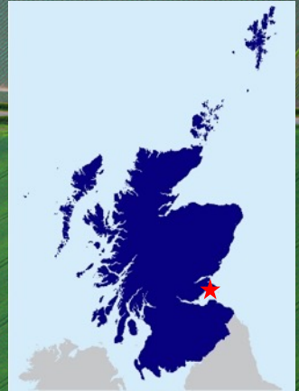
18 th century salt pans, St Monan's