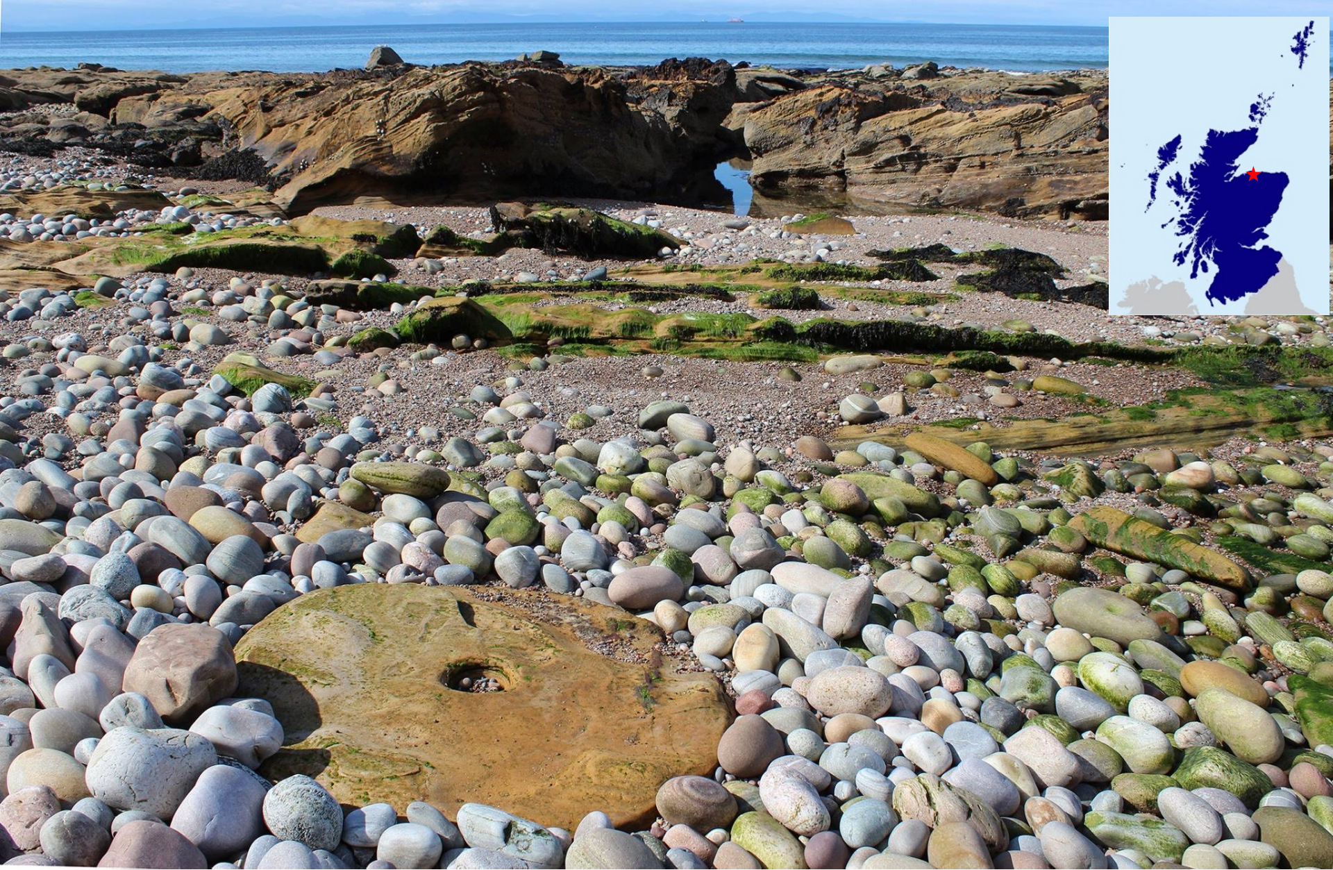
Post-medieval millstone quarry, Cove Sea