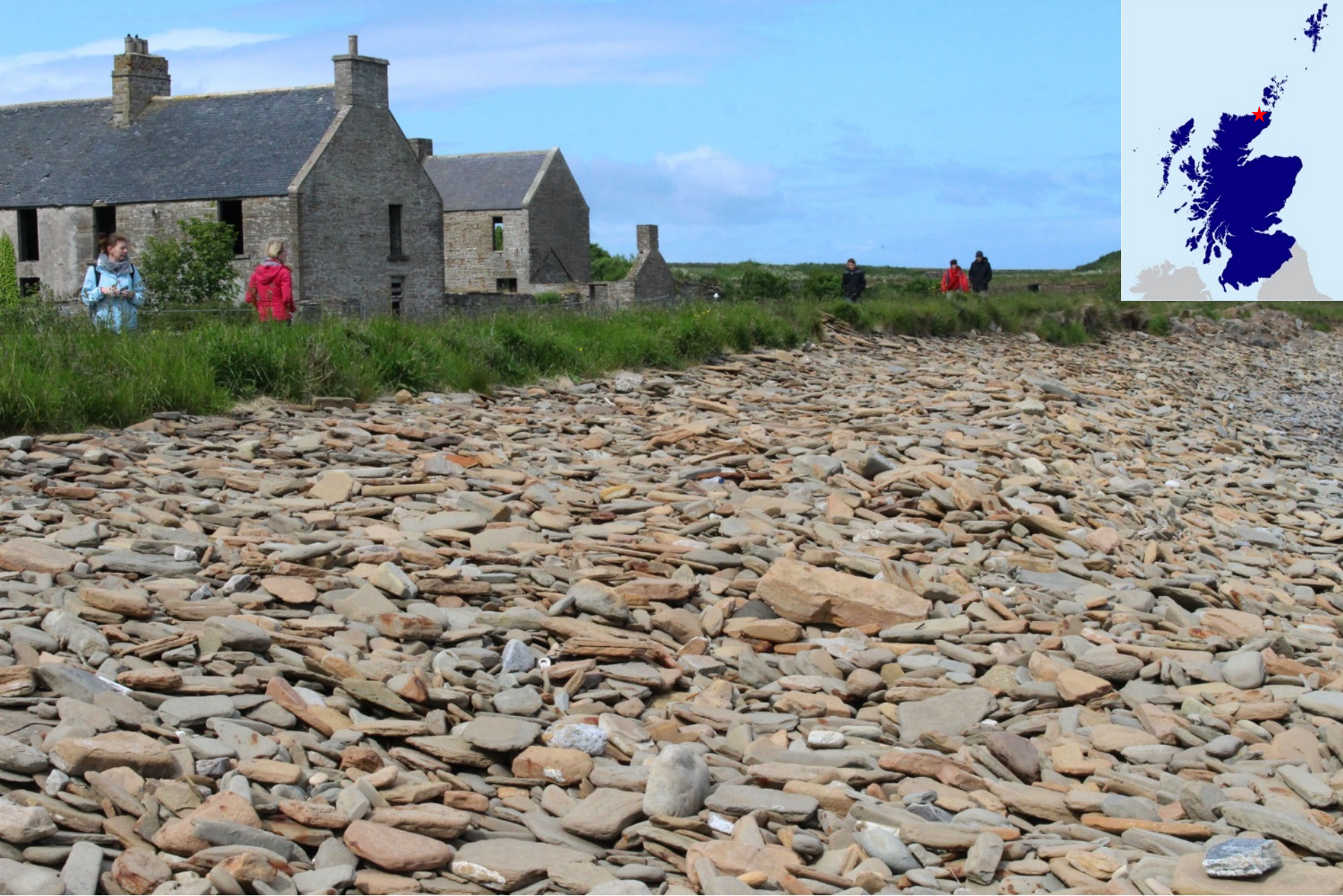
18 th -20 th century pavement works, Castletown