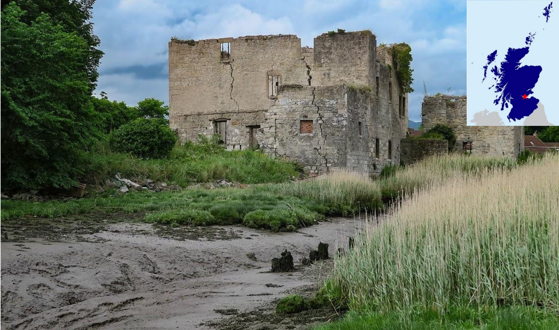
18 th -19 th century Kennet Pans (birthplace of Jamieson's and Haig whisky)