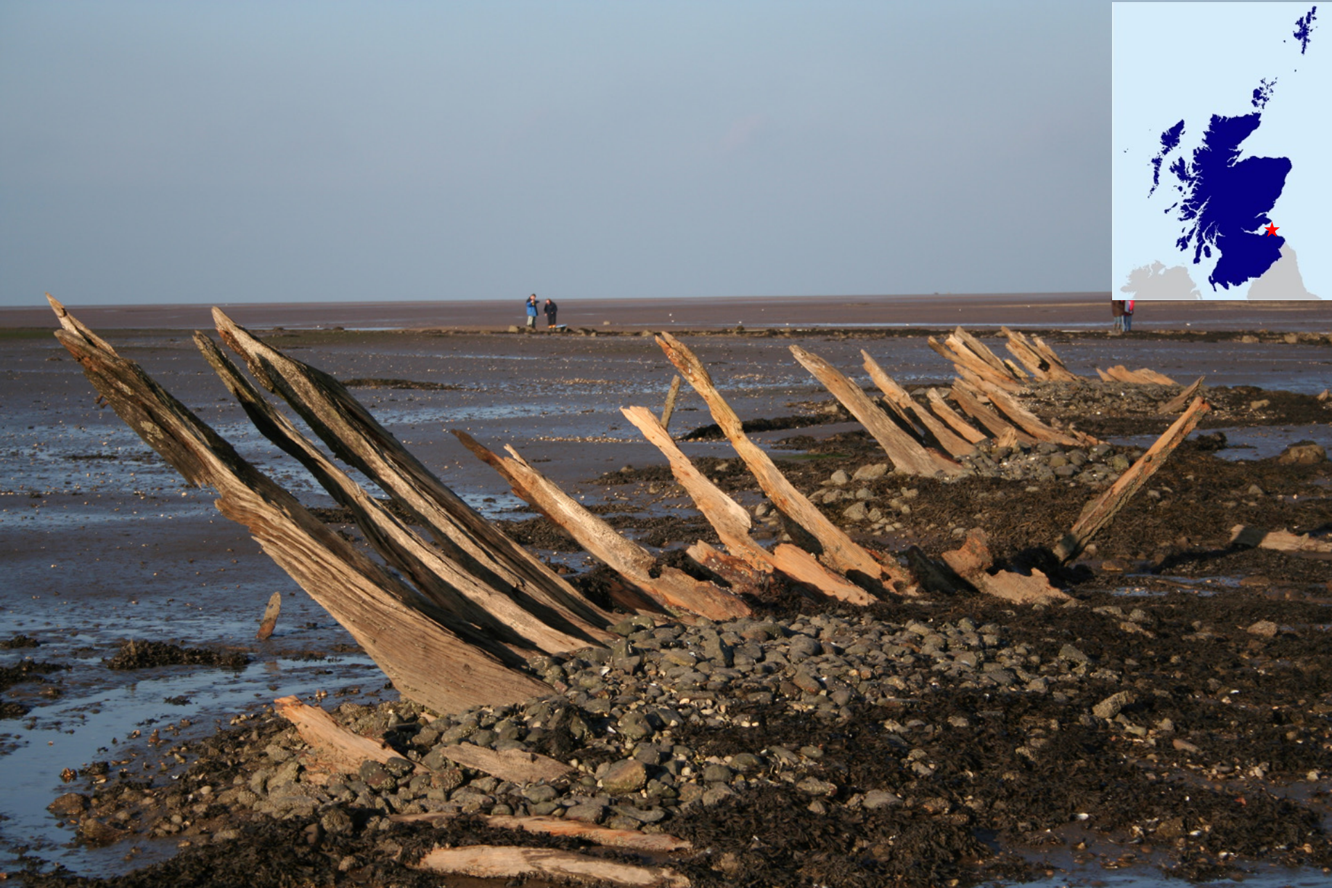
19 th century Zulu boat remains, Aberlady Bay