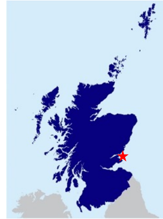
18 th -19 th century Pile Light, Dundee