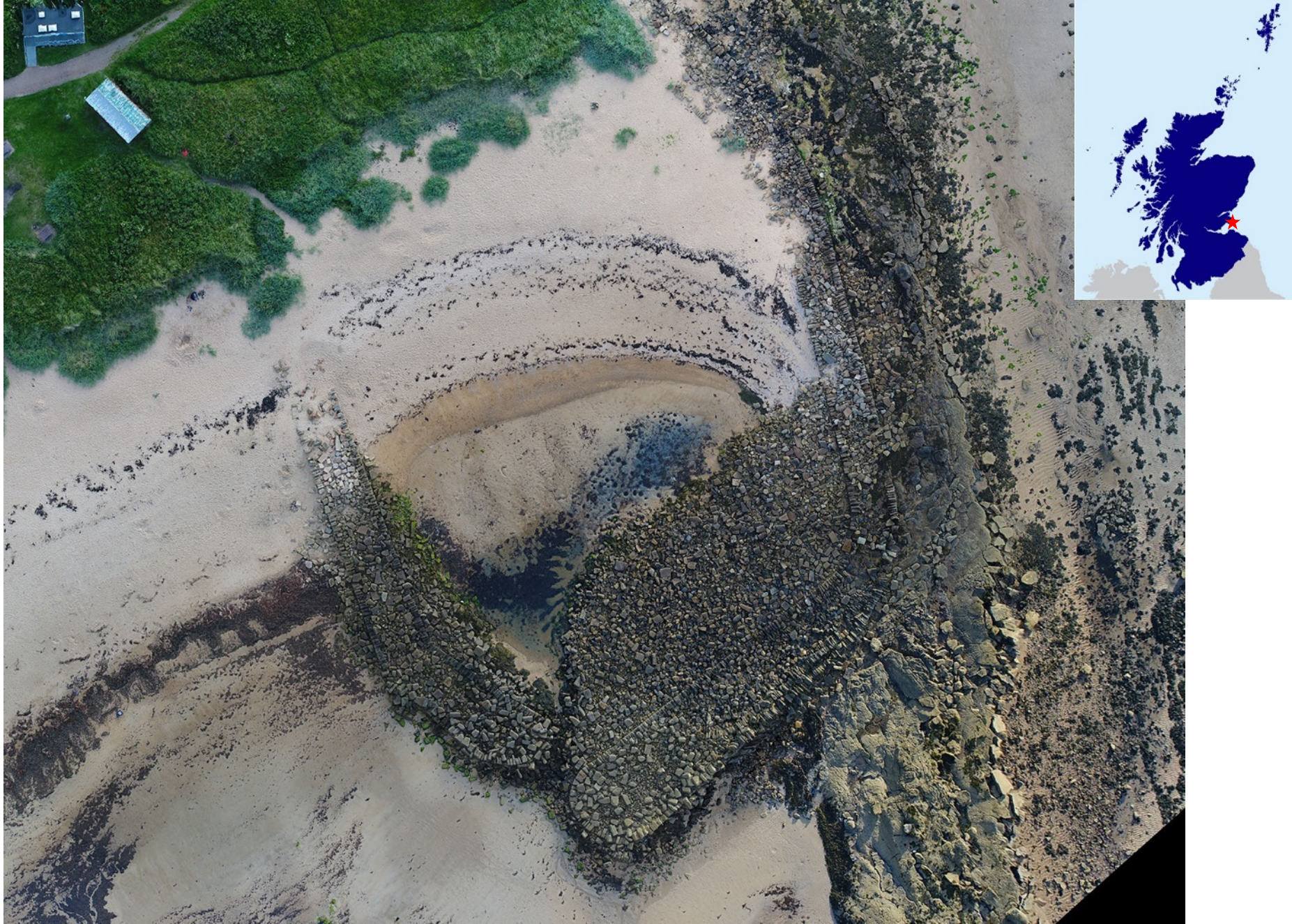
19 th century Kingsbarns harbour