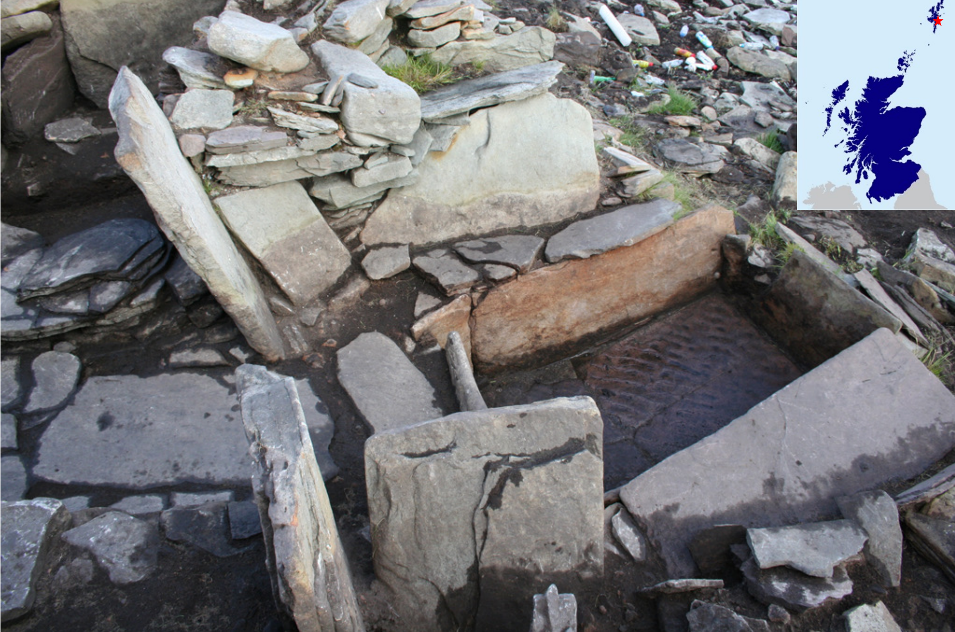
Bronze Age burnt mound, Shetland