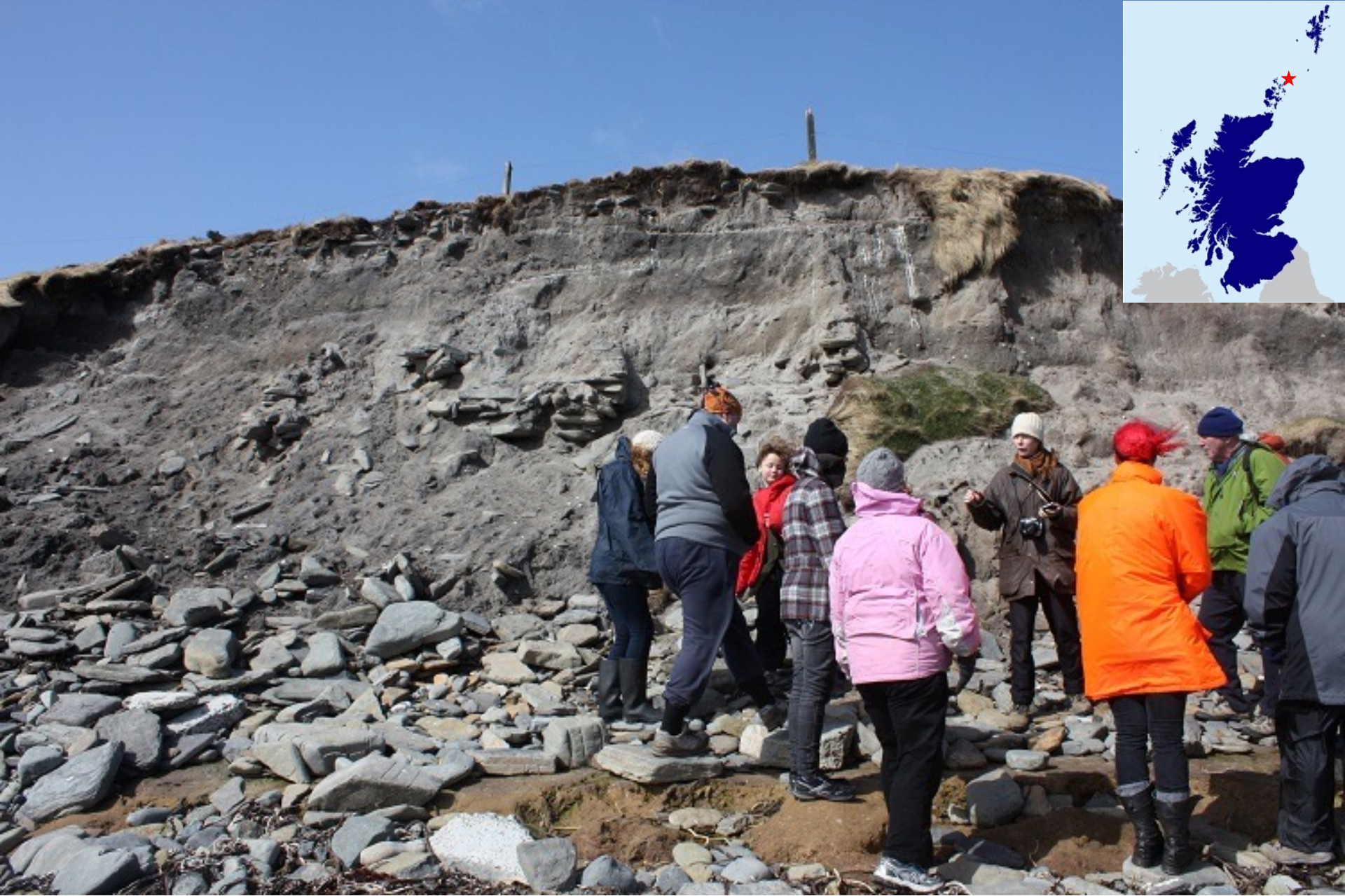
Norse? settlement mound, Sanday