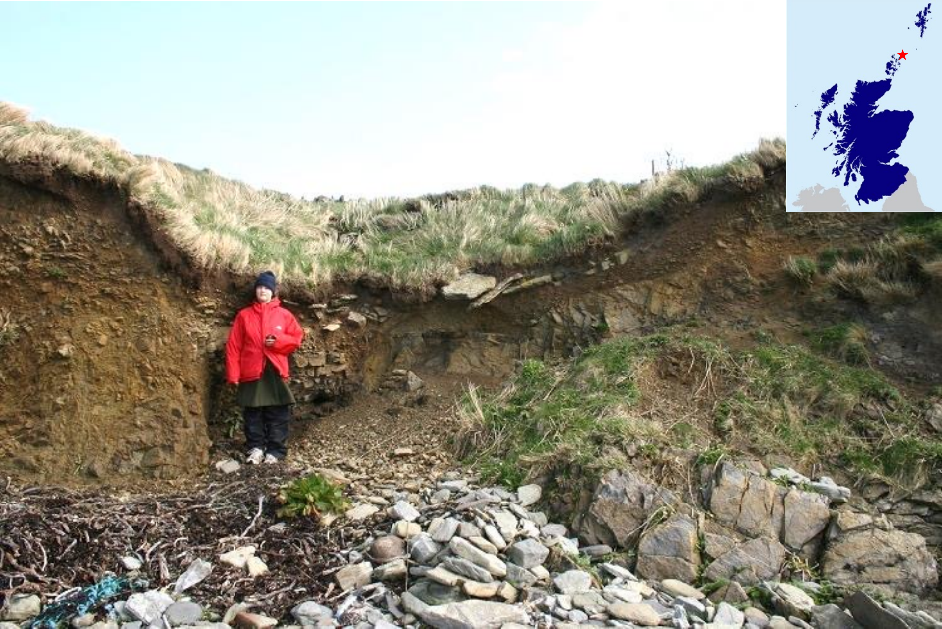
18 th century kelp burning pit, Sanday