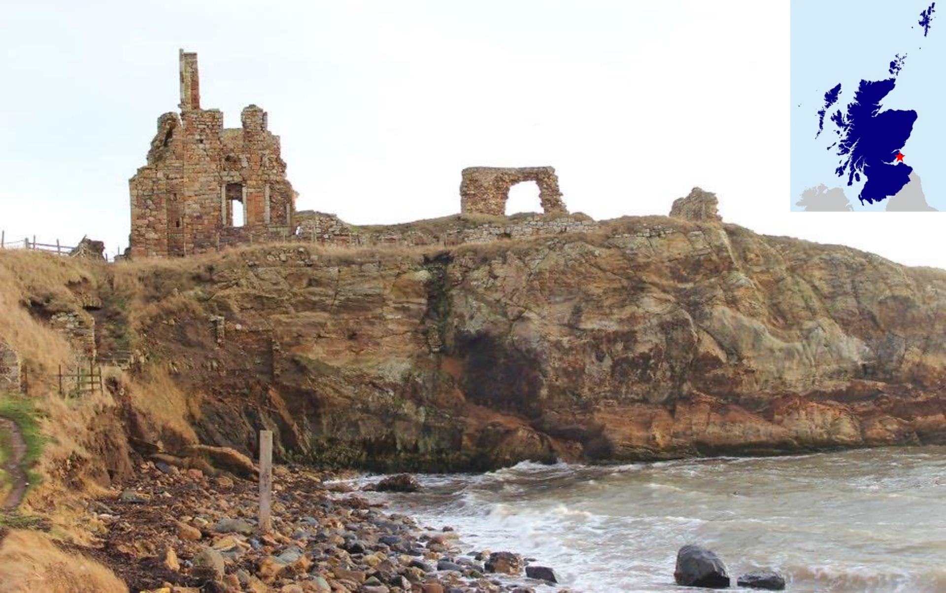
Medieval tower house, Newark Castle