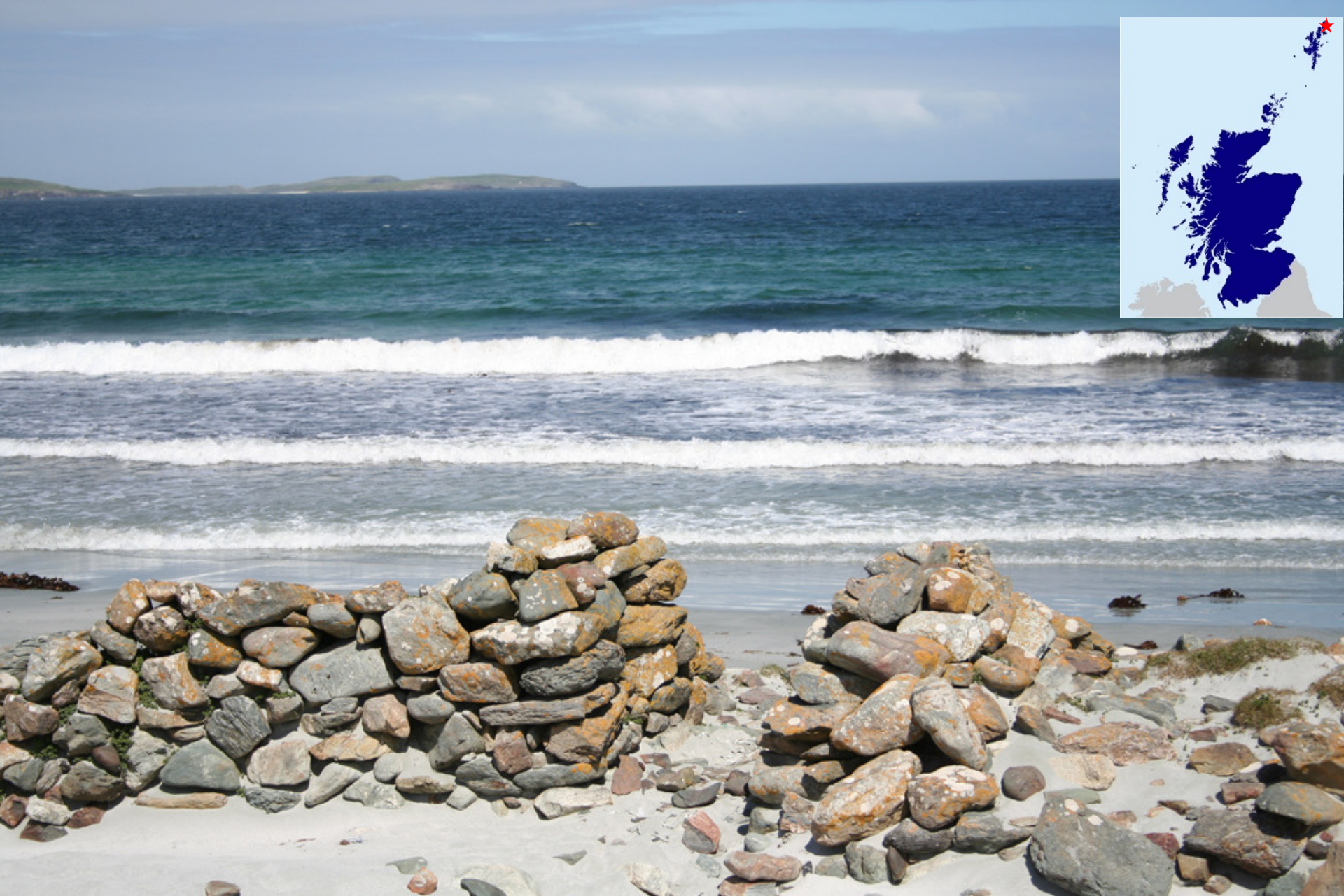
Norse house, Sandwick, Shetland