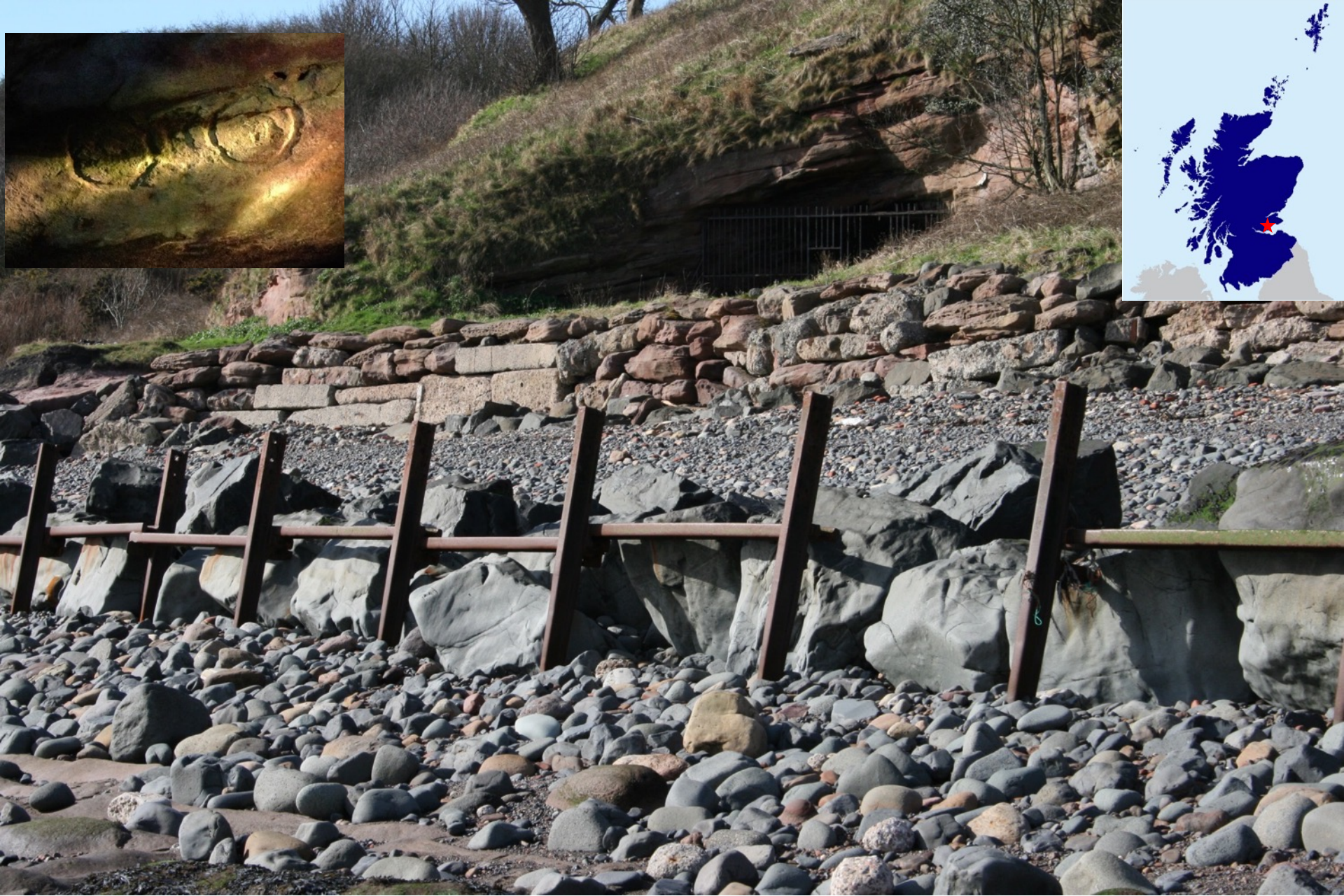
5 th century Pictish carvings in the Wemyss Caves