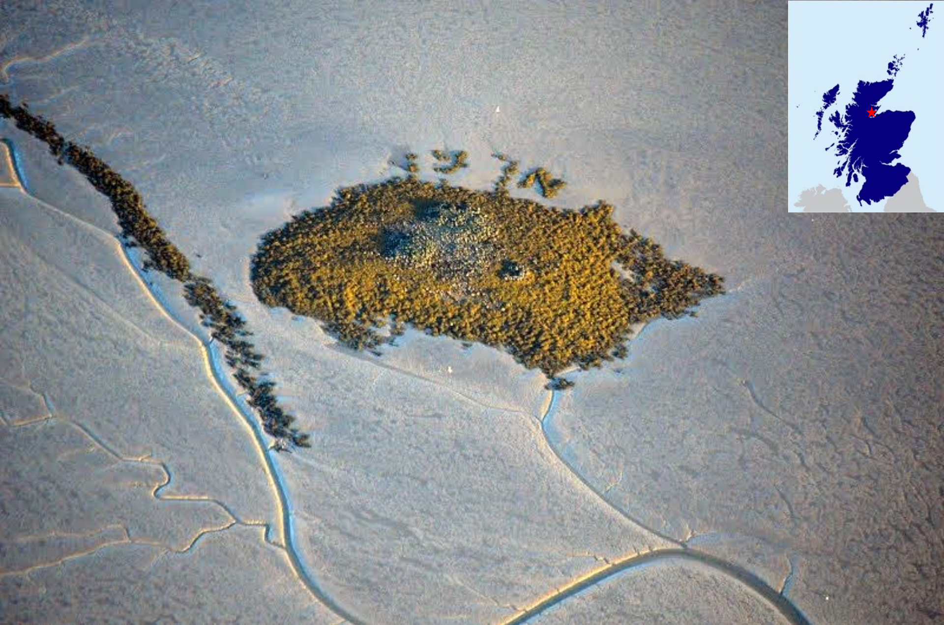
Iron Age crannog, Beaulieu Firth