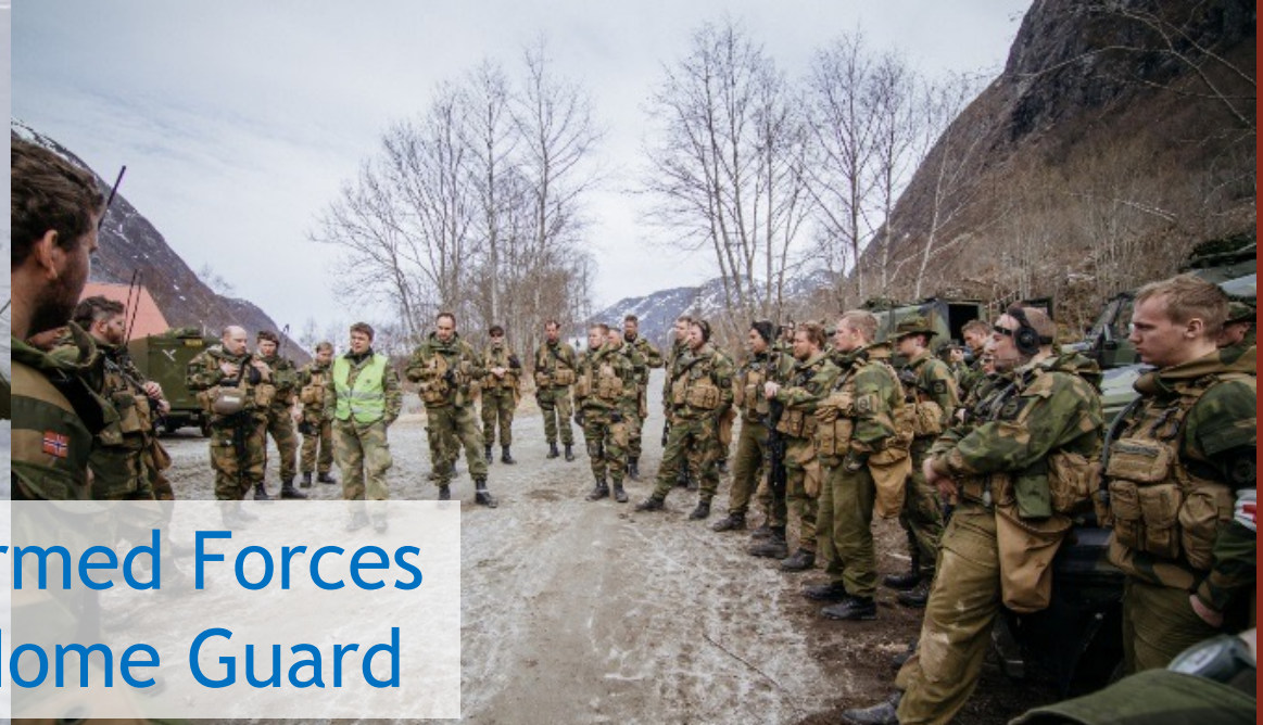
Norwegian Armed Forces Norwegian Home Guard