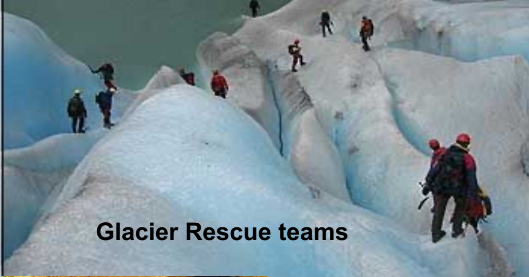
Glacier Rescue teams

Voluntary organisations - Rescue- units available at short notice 12,500 personell