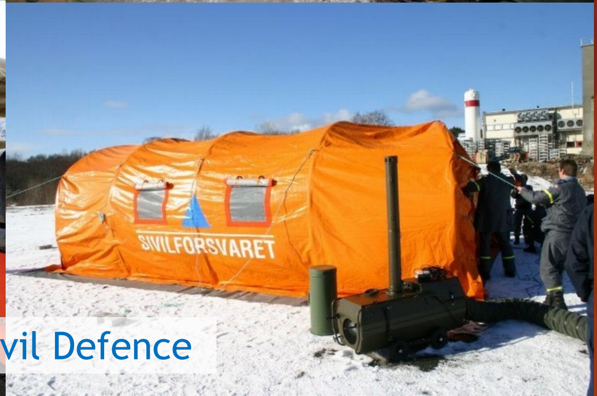
Norwegian Civil Defence