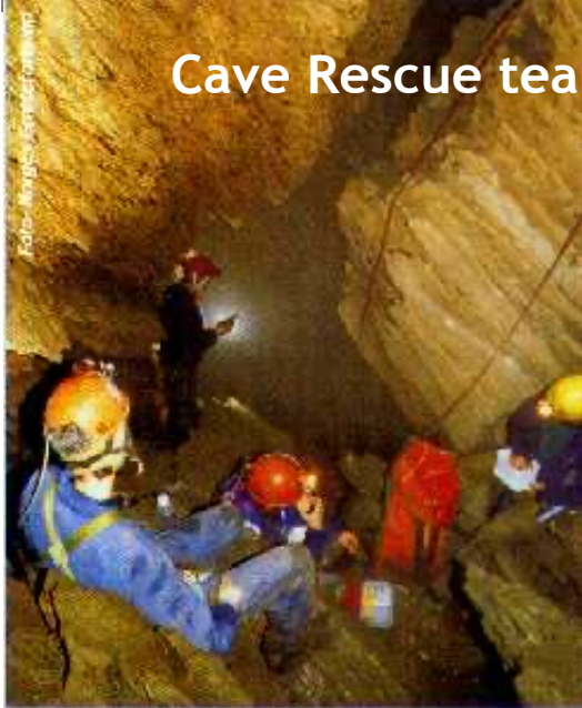
Cave Rescue teams