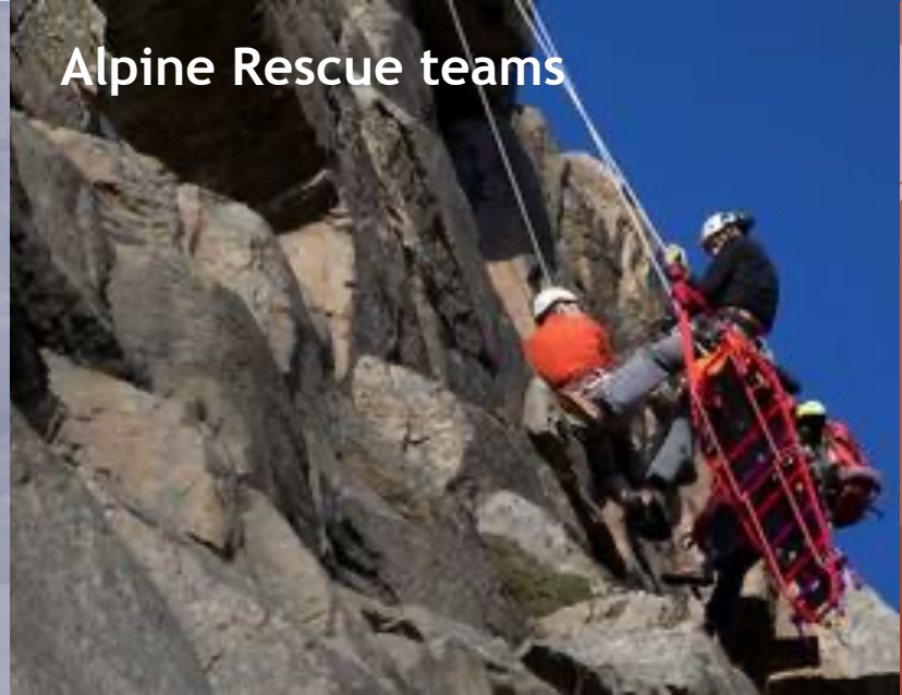
Alpine Rescue teams