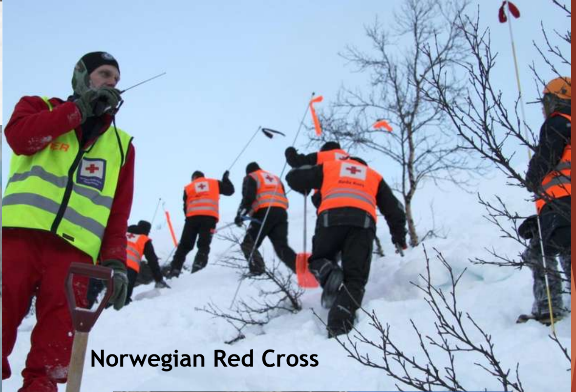
Norwegian Red Cross